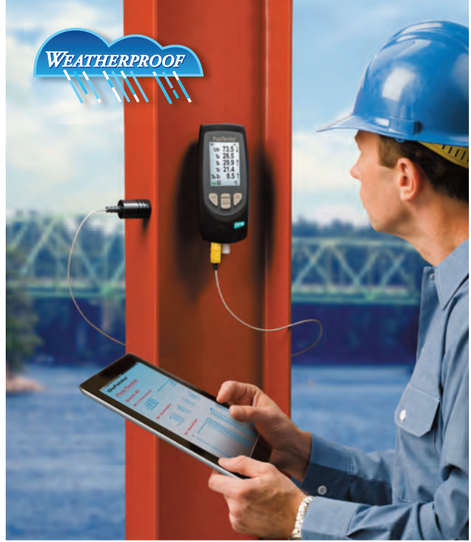
Analyze uploaded readings using a web browser from anywhere – jobsite or head office.